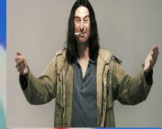
MEMBER SPOTLIGHT Mad Dog